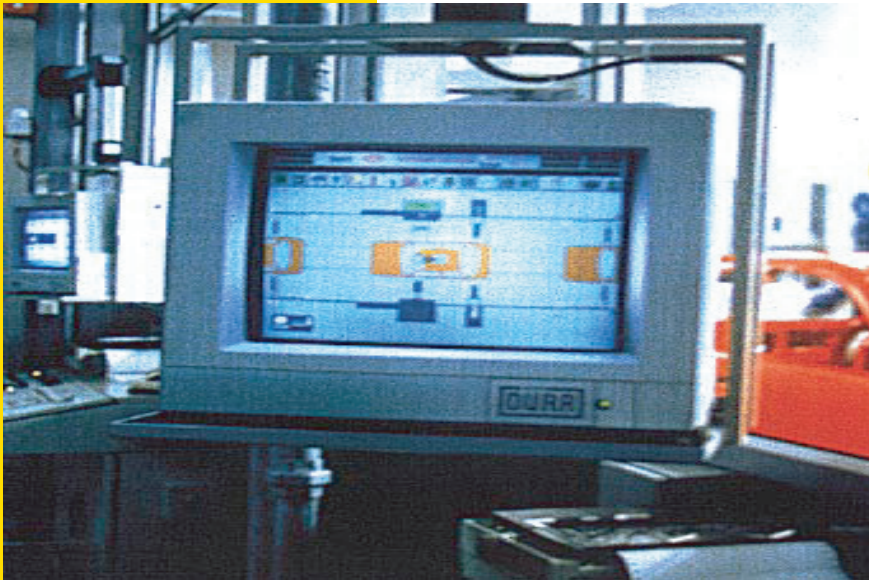
Operators manning the Dürr Ecopaint system have an exact on-screen replica of each vehicle's progress through the painting booth.

Dürr Painting needed a system that would work for multi-national customers such as General Motors, Volkswagen, Daimler Benz, BMW or Fiat. □