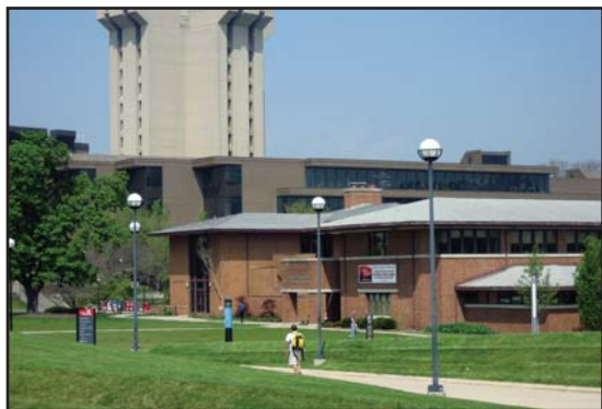
Wonderware is used by many customers for utility and building management.

Wonderware provides an open architecture that can reduce your system's total cost of ownership. We offer years of experience integrating multiple systems, devices and enterprise applications for thousands of facilities around the world. But don't take our word for it; consider the experience of others by reading the following real-world success story.